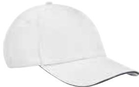
BBB825C EARTHWARE® CLASSIC ORGANIC COTTON 5 PANEL CAP SANDWICH PEAK