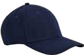
BBB820 EARTHWARE® CLASSIC ORGANIC COTTON 6 PANEL CAP