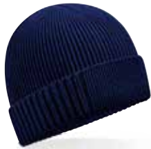
BBB438N ORGANIC COTTON ENGINEERED PATCH BEANIE