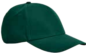
BBB825 EARTHWARE® CLASSIC ORGANIC COTTON 5 PANEL CAP