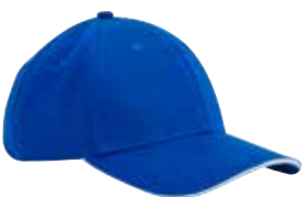
BBB820C EARTHWARE® CLASSIC ORGANIC COTTON 6 PANEL CAP SANDWICH PEAK