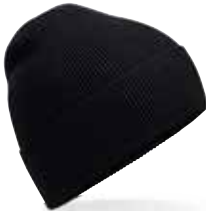
BBB51N ORGANIC COTTON FINE KNIT BEANIE