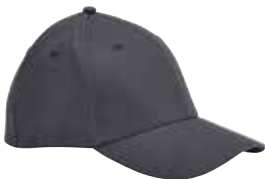
BBB803 EARTHWARE® ORGANIC COTTON STRETCH FIT CAP