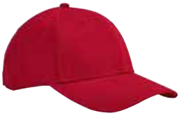
BBB821B EARTHWARE® JUNIOR CLASSIC ORGANIC COTTON 6 PANEL CAP