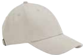
BBB801 EARTHWARE® ORGANIC COTTON CANVAS 6 PANEL CAP